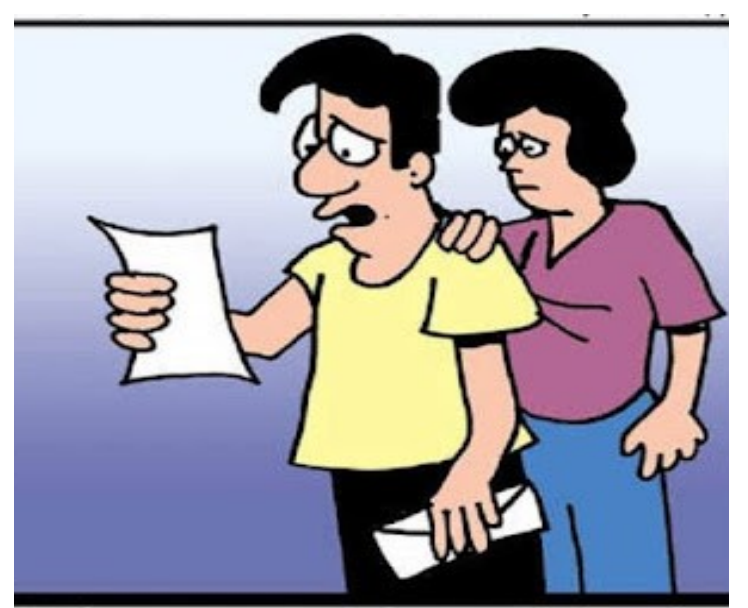
Its from our church... we've been called up for active duty."